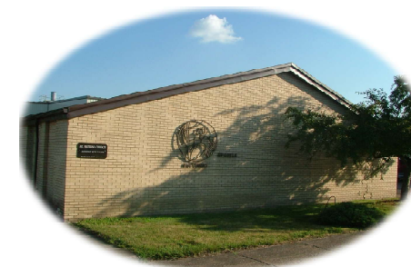
St. Matthias Freeport