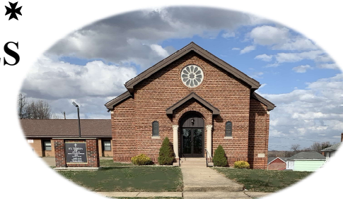
St. Teresa of Avila Cadiz